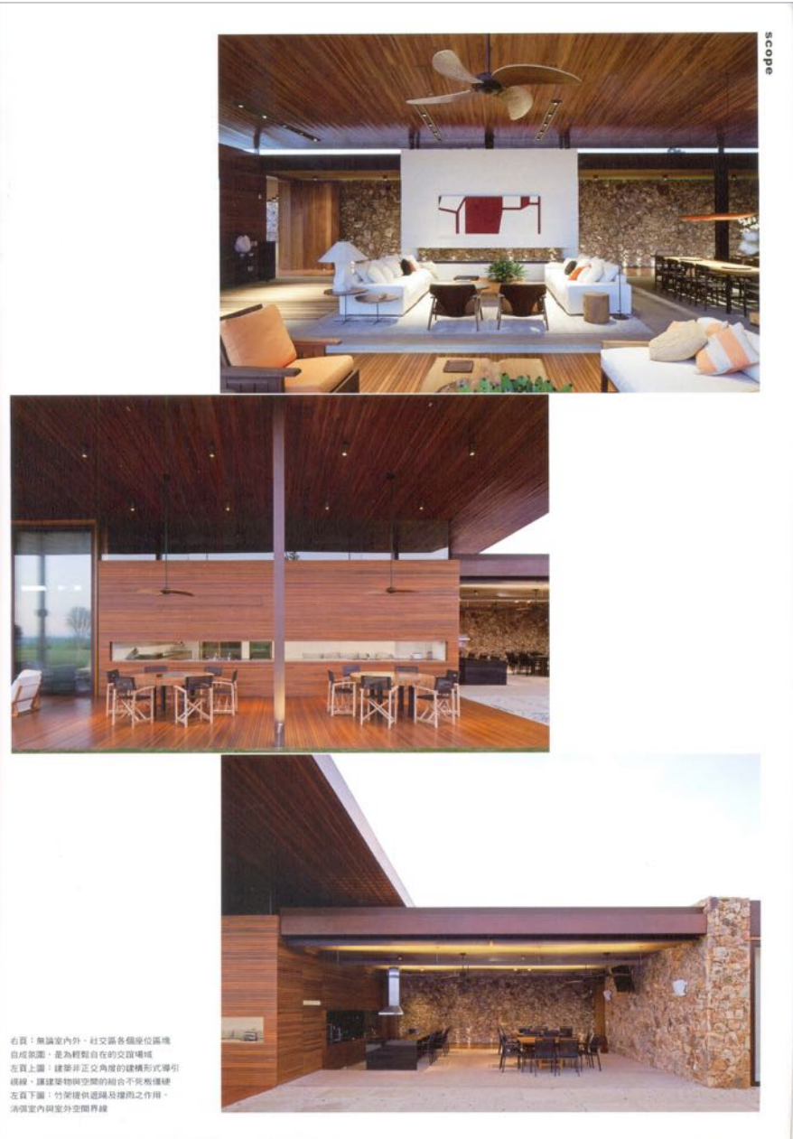
右頁：無論室內外，社交區各個座位區域自成氛圍，是為輕鬆自在的交誼場域 左頁上圖：建築非正交角度的結構形式吸引視線，讓建築物與空間的組合不覺地連續 左頁下圖：竹葉提供遮陽及採光之作用，消弭室內與室外空間界線